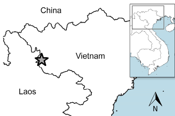
FIG. 3. Map showing the type locality of Rhioostoma ninhbien sp. nov., from Dien Bien Province, Vietnam (star)

РИС. 3. Типовое местонахождение Rhioostoma ninhbien sp. nov., провинция Дьен Бьен, Вьетнам (звездочка).